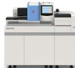
AIA-900 with 9 Tray Sorter Also available with 19 tray sorter option and as Loader model